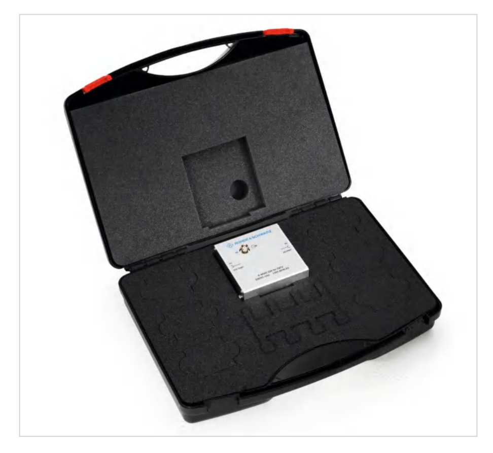
R&S®ENY81-CA6 base unit in carrying case.