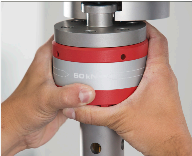
50 kN Load Cell with Quick-Mount kit