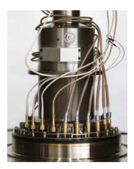
The Ultrasonic Velocity triaxial platens propagate a compression wave and two orthogonal shear waves along the longitudinal axis of the core sample. The system then measures the time of flight through the specimen, calculating dynamic elastic properties that can be compared to static properties collected using traditional techniques.