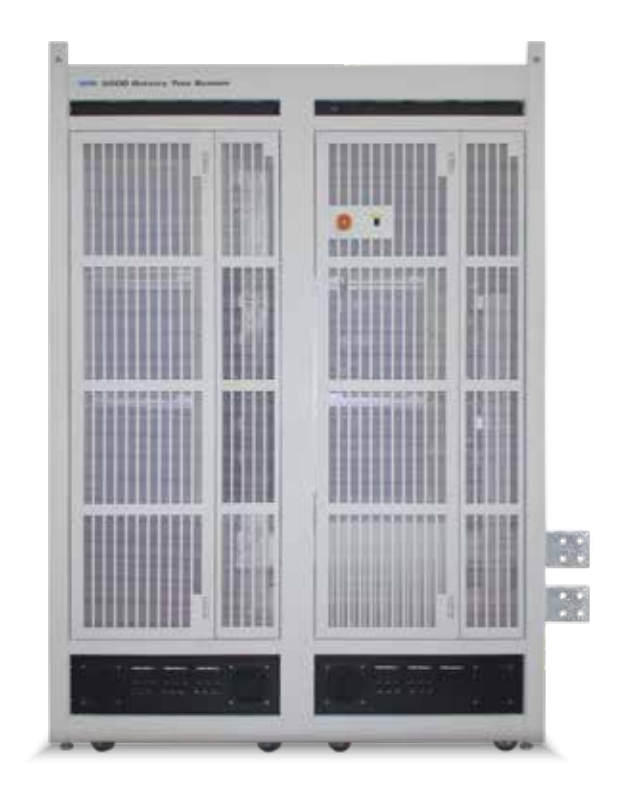
9220 Dual Bay Test System front panel view

The 9220 Dual Bay Series Test System is designed for testing all battery chemistries including lead-acid, lead-cadmium, and other low voltage, high current, large format batteries (LFB) typically used in energy storage systems (ESS). The system is bi-directional requiring no additional equipment to charge or discharge the unit-under-test (UUT). Additionally, the built-in measurement system eliminates external measurement devices by providing time-stamped digital readings for voltage, current, power as well as Ah and kWh.