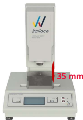
Easy conversion to standard operation