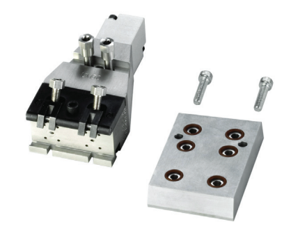
Adapter plate allows easy change from UM25 to UM50 modules.