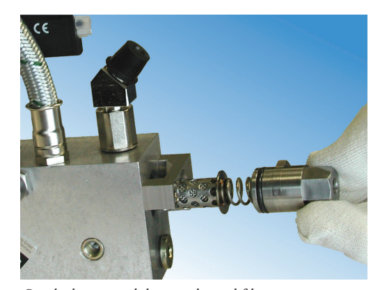
Quick-change modules, nozzles and filters minimize downtime.

For more information, speak with your Nordson representative or contact your Nordson regional office.