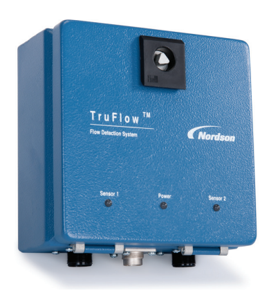
TruFlow single converter control box

Actuation Air Pressure Refer to module data sheet