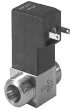
RME 005 A, Gas regulating valve, solenoid actuated, control range from 0.085 to 8.5 hPa l/s