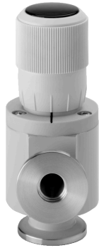
EVD 010 H, Coarse gas dosing valve, manually actuated